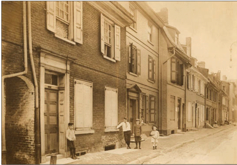
Elfret's Alley - 1910

A Hetrick Family of Philadelphia, Pennsylvania